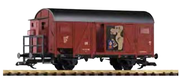
37966 G10 Boxcar Fit DR III