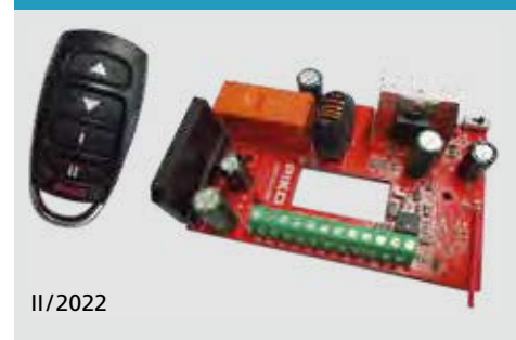
35042 R/C Loco Receiver 5A, Pure DC w/Remote