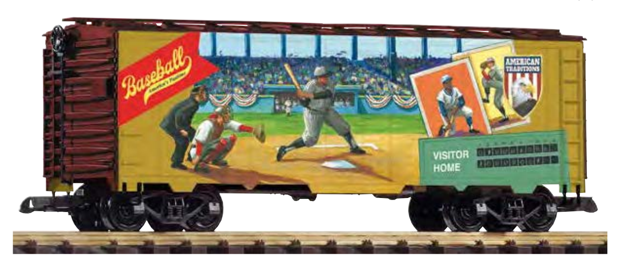
38923 American Traditions: Baseball Reefer