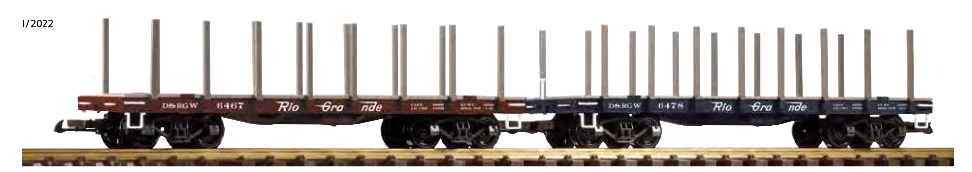
38778 D&RGW Flatcar w/Stakes, 2-Pack