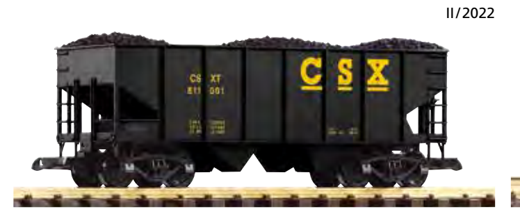
38934 CSX Rib-Side Hopper