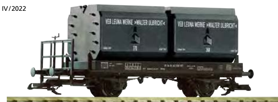
37773 DR IV Coal Container Car w/Brake Platform