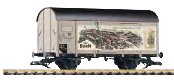
37965 G10 Boxcar Born DR III