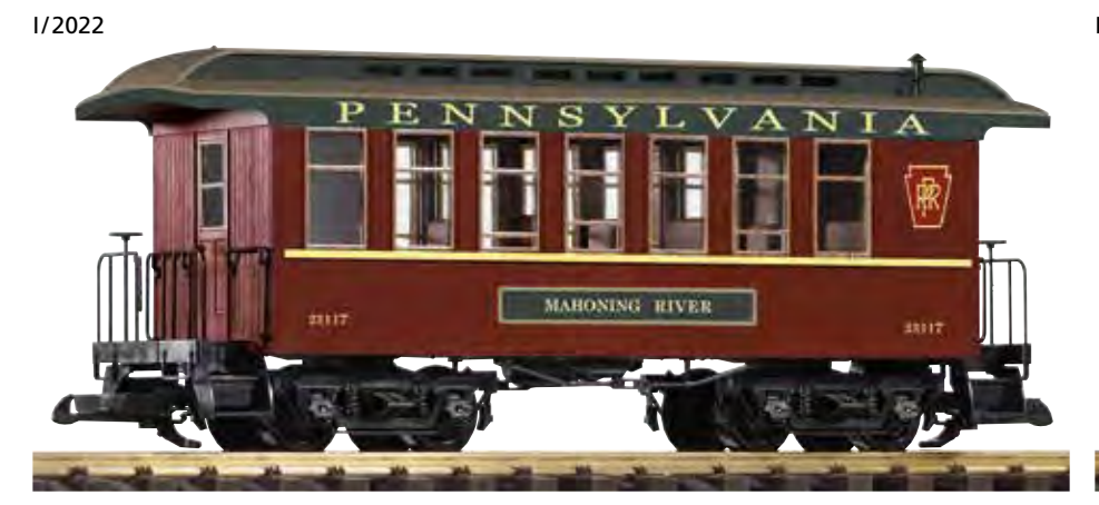
38657 PRR Wood Coach 23117