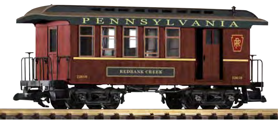
38659 PRR Wood Combine 22610