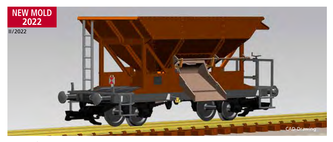
37850 Self-Unloading Hopper DR IV