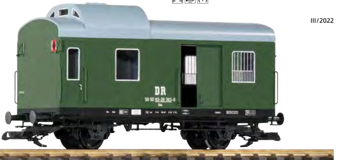
37842 Baggage Car Pwg 88 DR IV