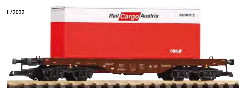
37011 Container ÖBB V