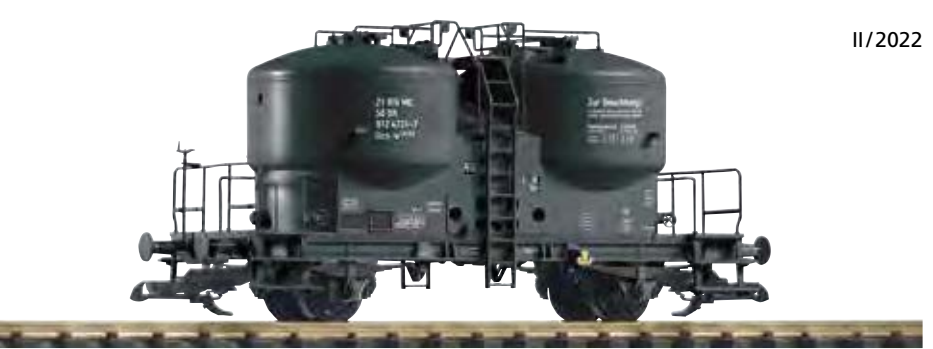
37796 Cement Silo Car Gray Chassis DR IV