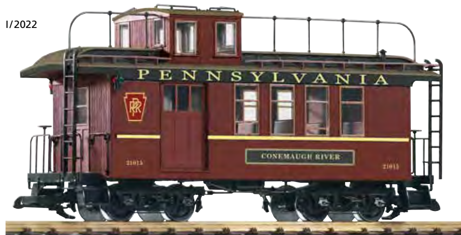
38660 PRR Drovers Caboose 21015