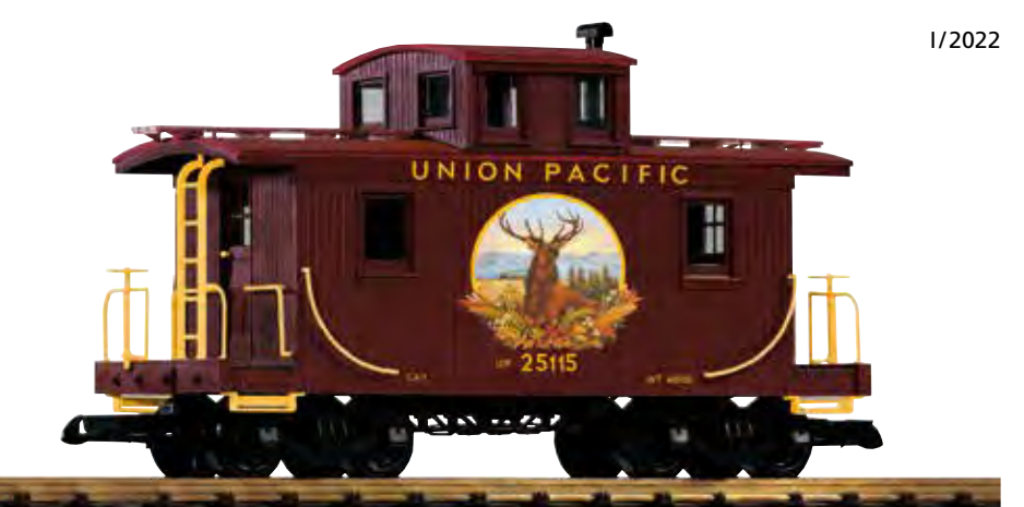
38948 UP Wood Caboose