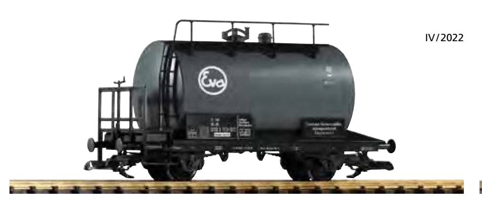
37967 2-Axle Tank Car Eva DB IV