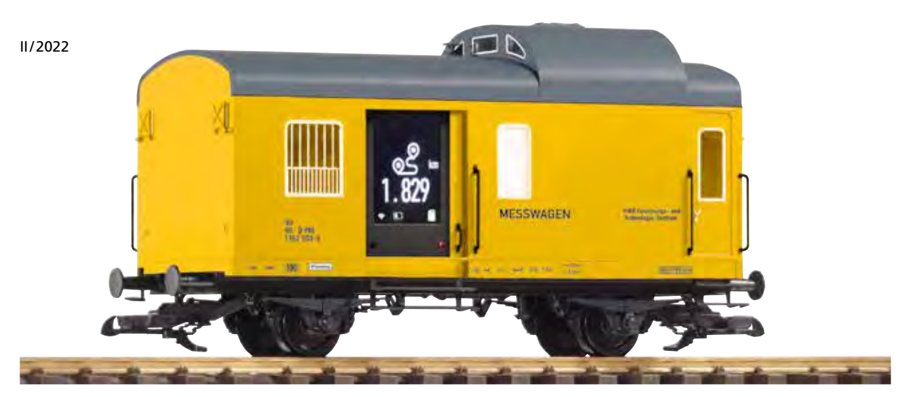
37841 Measuring Car Pwg 88