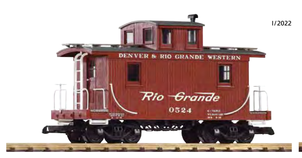
38947 D&RGW Wood Caboose