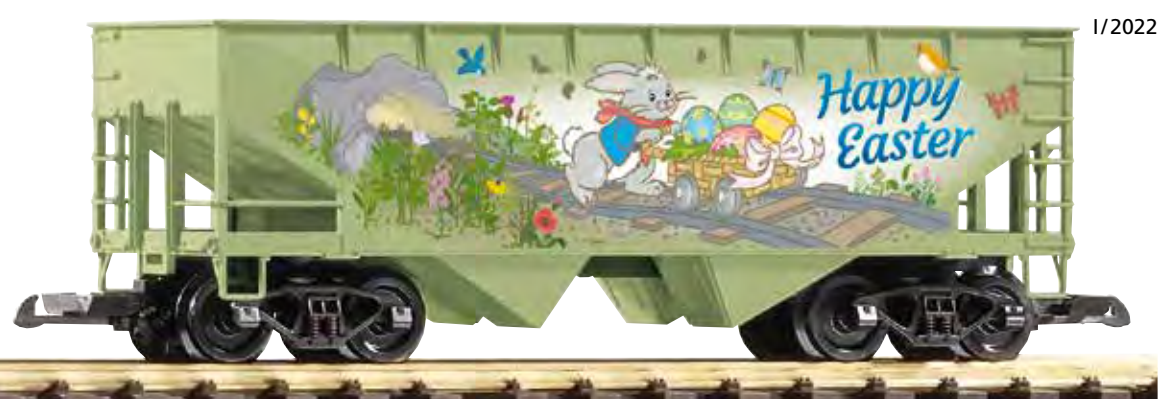
38935 Easter Egg Mine Hopper