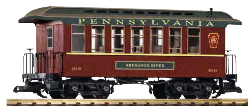
38658 PRR Wood Coach 23119