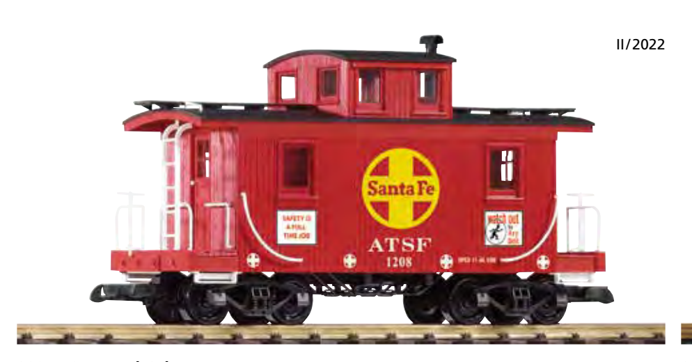
38945 SF Wood Caboose