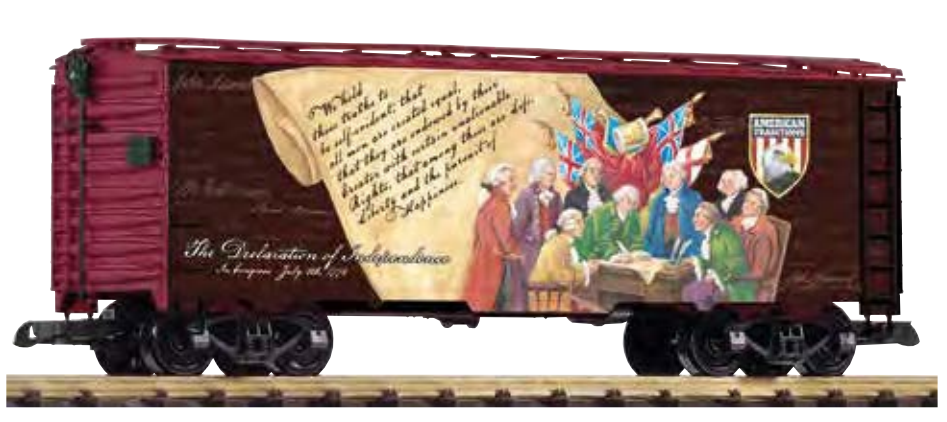
38942 American Traditions Independence Reefer