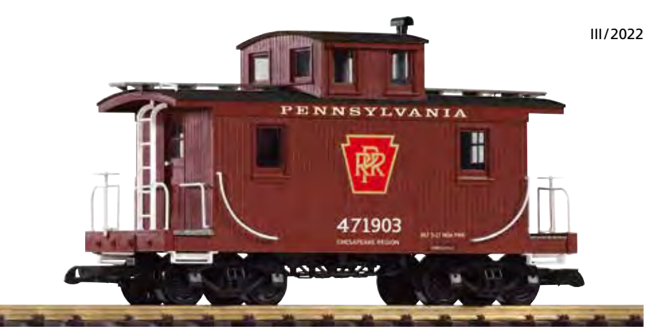
38946 PRR Wood Caboose