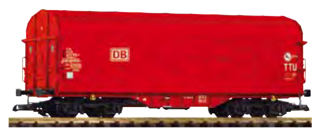
37724 Tarp Car Shimmns Cargo DB V