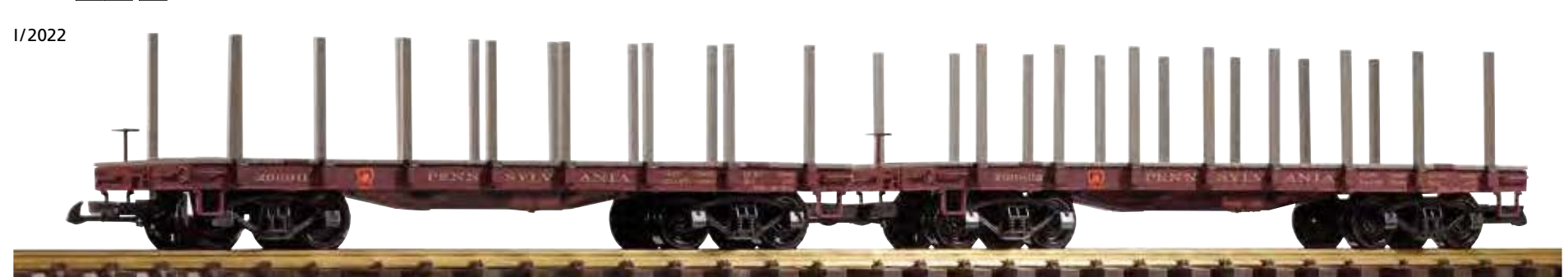
38779 PRR Flatcar w/Stakes, 2-Pack